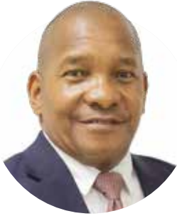
SHARIFF ALI SHARIFF, MINISTER OF STATE IN THE PRESIDENT'S OFFICE FOR LABOUR, ECONOMY, AND INVESTMENT