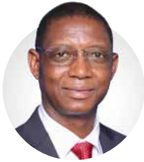
EMMANUEL TUTUBA, GOVERNOR OF THE BANK OF TANZANIA