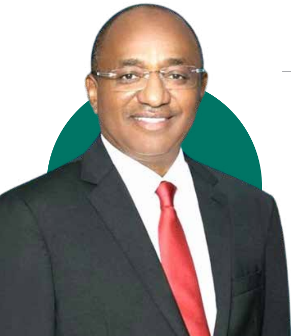
H.E. DR. HUSSEIN ALI MWINYI, PRESIDENT OF ZANZIBAR