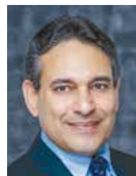
RAVNEET CHOWDHURY, CEO OF DIAMOND TRUST BANK TANZANIA PLC

The digital revolution assumes a pivotal role in DTB's strategic vision, guided by a firm belief that the future of banking lies