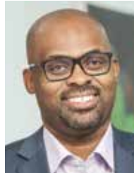
BENEDICT BUSUNZU, CEO OF TEMBO NICKEL

When describing the project's socio-economic impact, Busunzu stresses the government's vision for strategic minerals and green technologies. "We will unlock nickel, copper, and cobalt from Kabanga, providing lower cost, lower emissions (relative to smelting), and traceable metals for electric vehicle batteries and to support